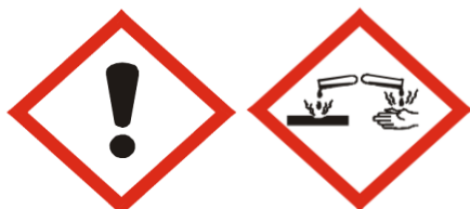
Exclamation mark (GHS07)