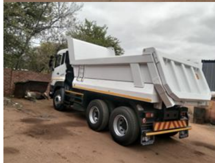
Figure 5: Lephalale Local Municipality