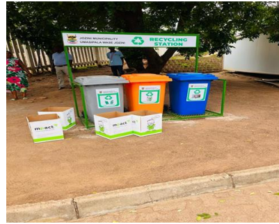
Figure 8: Jozini Local Municipality

Therefore, the department urges all municipalities in the country to take advantage of the changes in COGTA MIG policy to purchase various waste management fleets through respective MIG/ USDG allocations. Consultation with the MIG/USDG Project Manager within respective municipalities will be beneficial to see how much is allocated for waste project, especially fleets in every financial year.