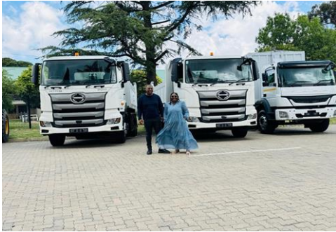
Figure 7: Senqu Local Municipality