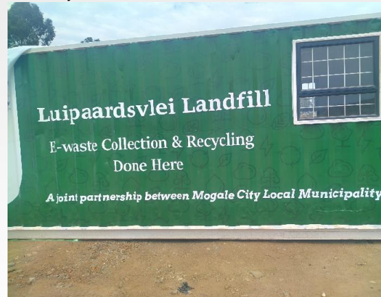
Figure 1: e-Waste collection and recycling container.

This partnership fulfils the purpose of the regulations to ensure the effective and efficient management of the identified end-of-life products and to encourage and enable the implementation of the circular economy initiatives.