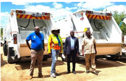
Figure 2: Musina Local Municipality