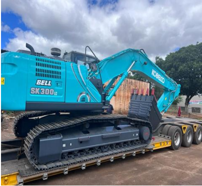
Figure 1: Mkhondo Local Municipality