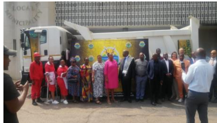
Figure 4: Modimolle Local Municipality