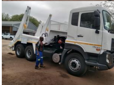
Figure 6: Lephalale Local Municipality