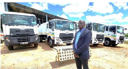
Figure 3: Musina Local Municipality