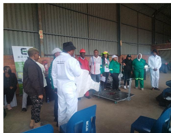
Figure 2: Donated trolley for waste-pickers