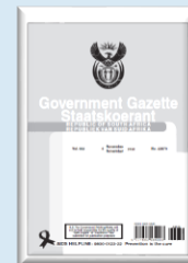
EPR regulations & notices